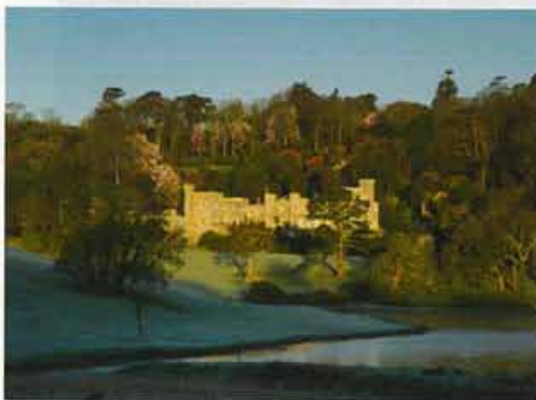
From top: spectacular St Mawes; Caerhays Castle at St Austell