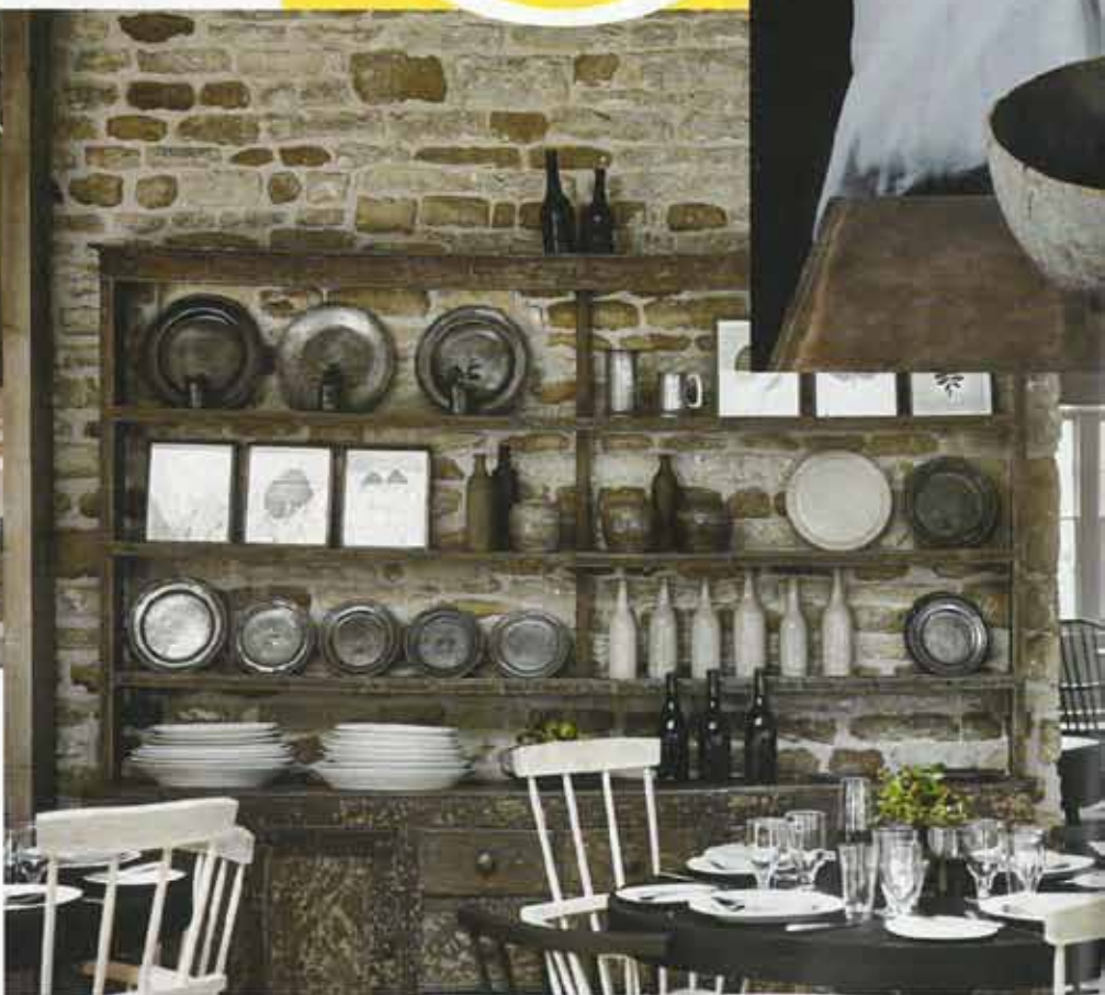
The Wild Rabbit restaurant and bar, right, and above, the Rabbit Room