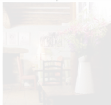
THE SWAN INN AT SWINBROOK Oxfordshire

This is bucolic Britain at its best, a wisteria-covered inn sitting beside the meandering River Windrush, facing a verdant cricket pitch – you'd almost expect a Mitford sister to come stalking past. Most fitting, given that the previous proprietress was the late Debo Devonshire, the youngest of the clan. Inside it's all oak beams, log fires, flagstone floors and Mitford memorabilia.