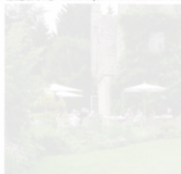
BARNSELY HOUSE Gloucestershire

BOOK IT Double, from £125 (theswanswinbrook.co.uk).